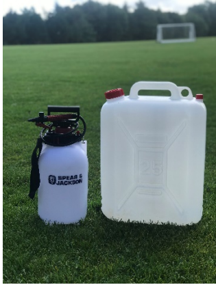
Sanitation Spray for Equipment

Changing rooms to be thoroughly cleaned prior to game.